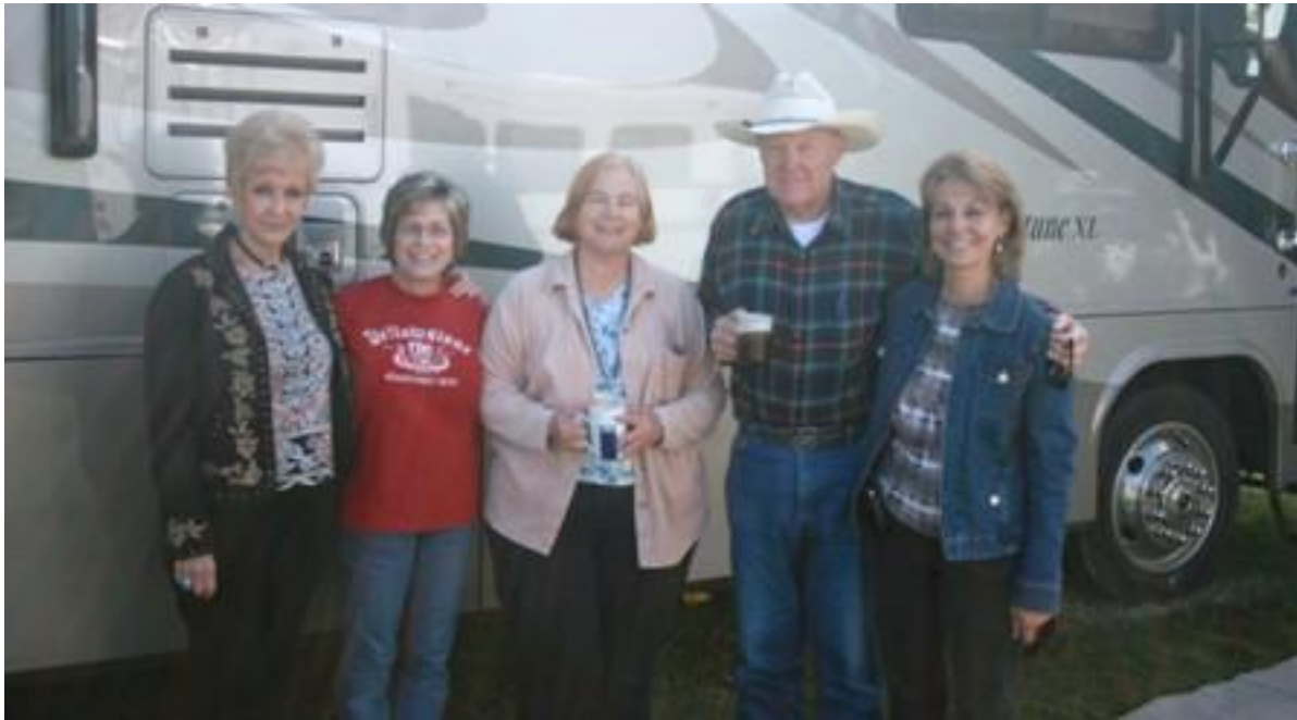
Border LoWs & SI visitors